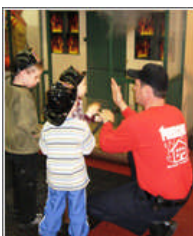
A fake fire scenario is just one of the activities children can take part in.

Aside from entertaining children, The FireZone also aims to make it easier for parents to throw birthday parties for their kids. From party supplies to food and drinks, the facility takes the burden of planning off the parents. "Our goal is to have a parent be able to book a date and then show up the day of the event with their child and a camera and enjoy the event just as much as their child is," Gantz says.