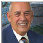
Changing the Playing Field --Again

With the recent rash of tainted imports, how can you be sure your goods are safe?