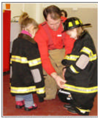
At The FireZone, kids get to try on authentic fire gear.