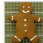
The Power of Nice